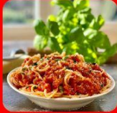
ITALIAN PASTA SAUCE