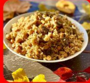
MIDDLE EASTERN PILAF