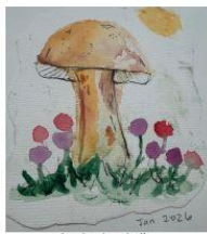
Watercolour by Valentina